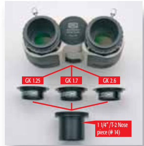
Maxbright-Bino with erecting 45° Roof Prism and integrated 2x Glasspath-Corrector.