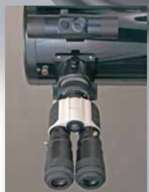
Maxbright-Bino with 3 optional Glasspath-Correctors and Nosepiece # 14