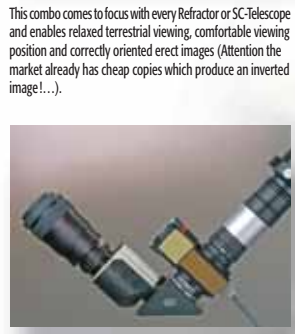
Maxbright-Bino, attached flat onto the Baader-2" Herschelwedge, providing shortest optical train – for any make of telescope.