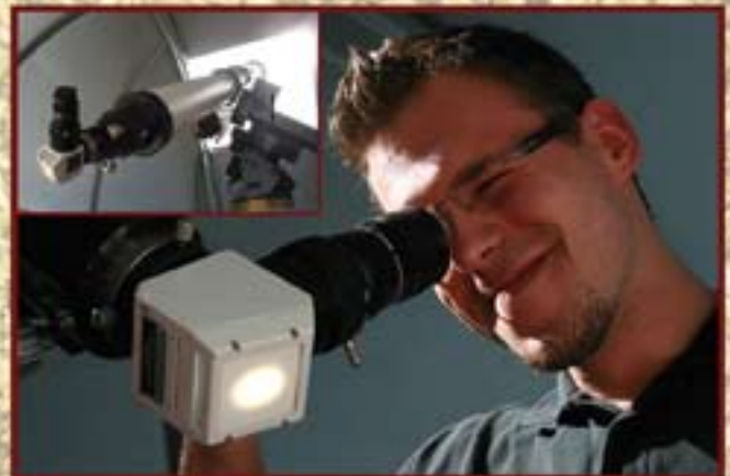
Safety Herschel Wedge at 200mm Zeiss Refractor

Cool-ceramic tile absorbs solar energy without excessive heat - at the same time serving as safe solar finder.