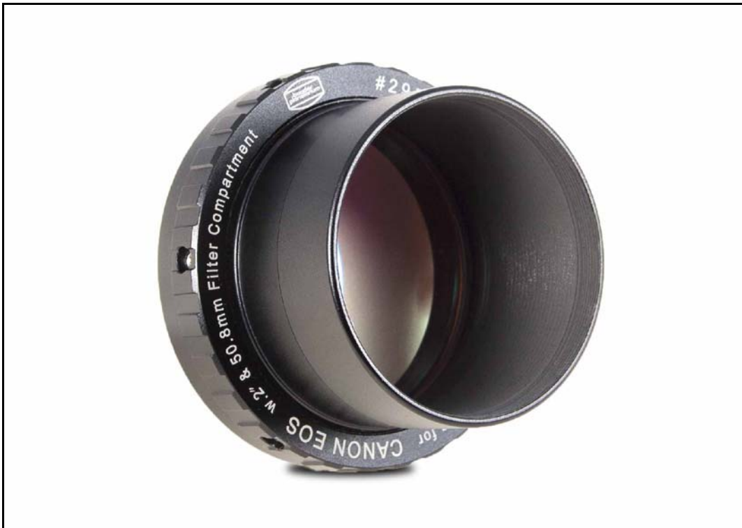
Fig. 3: Illustration: Protective T-Ring for Canon EOS with 2" socket (S52/2")