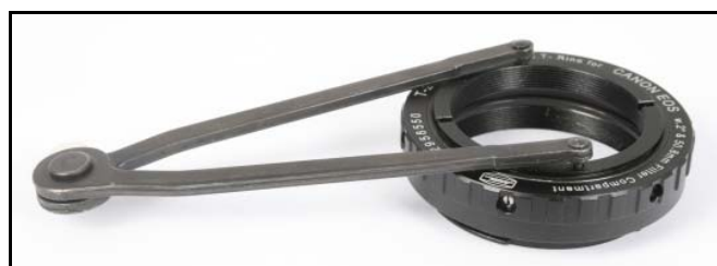
Fig. 8A: Optional, adjustable 2mm face spanner (#2450062)