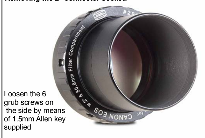
Removing the 2" connector socket:

Now insert the 2" connector socket and tighten the 6 Allen screws carefully and evenly. Sufficient tightness is achieved by using the long side of the Allen key.